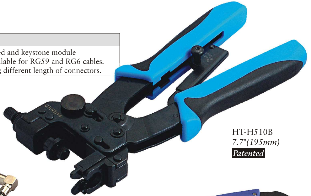
HT-H510B 7.7"(195mm) Patented

○ For crimping RG59, RG6 and RG11 F type compression connectors